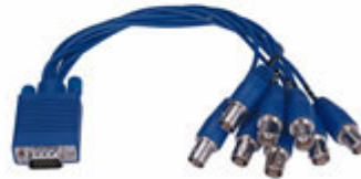
9-16 Cams Video Cable